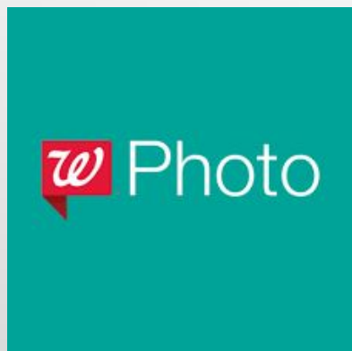
Photo in Basket